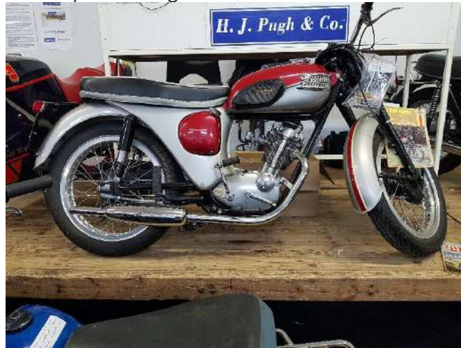
making this very useable 350 Tribsa look a real bargain at £2200.

The best collection of bikes for a long time. A packed house saw the 1955 Ariel square 4 with the Steib chair and the KH Kawasaki, (both featured in our Feb edition) sell for a hammer price of £12000 and £2600 respectively, while the Myford ML7 lathe made a predictable £620. This nicely restored and sensibly upgraded Tiger Cub was "knocked down" at an eye-watering £2800,